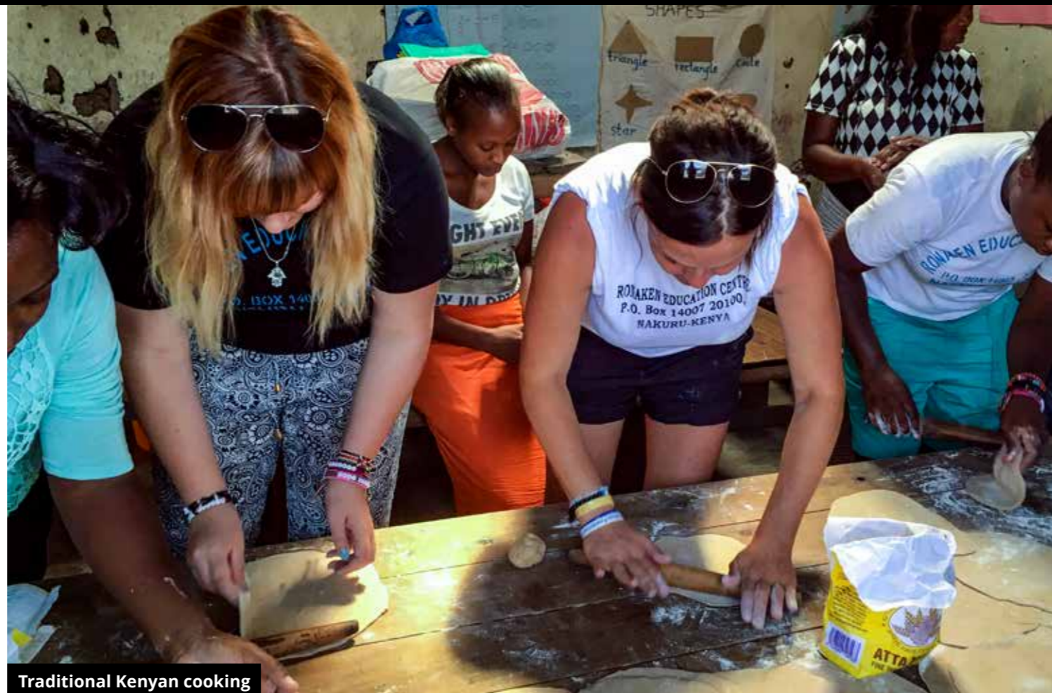
Traditional Kenyan cooking